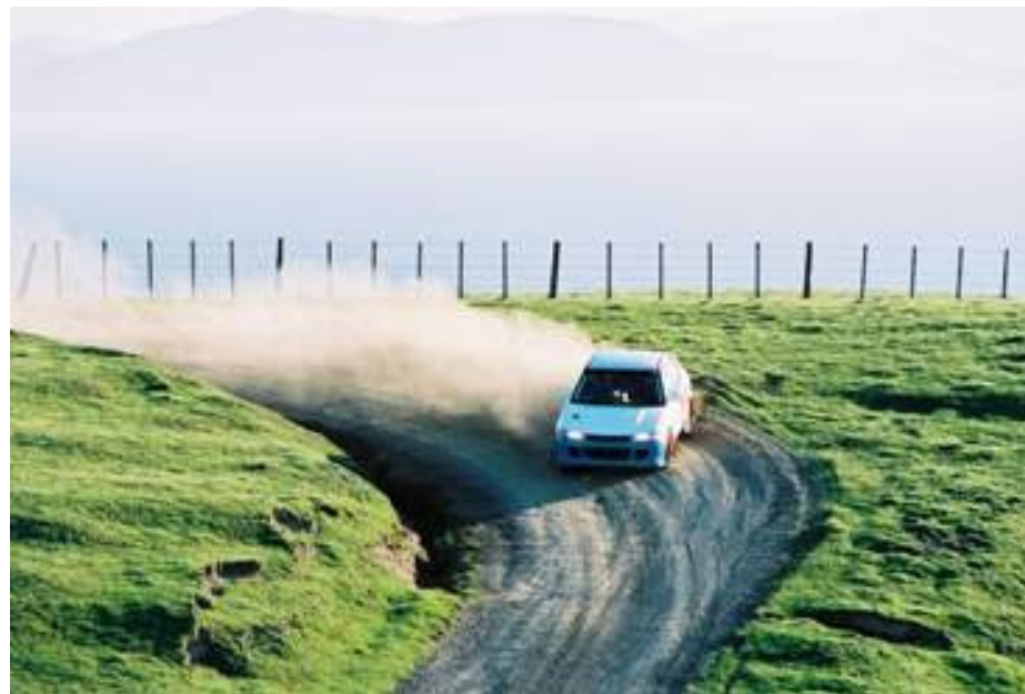
BOOMROCK – EXTREME EXPERIENCE EXCLUSIVE LOCATION

Boomrock has the most extreme golf holes to be found in the Southern Hemisphere, an aerobatic Pitt Special display, Claybird shooting and all accompanied with the finest of New Zealand's cuisine.