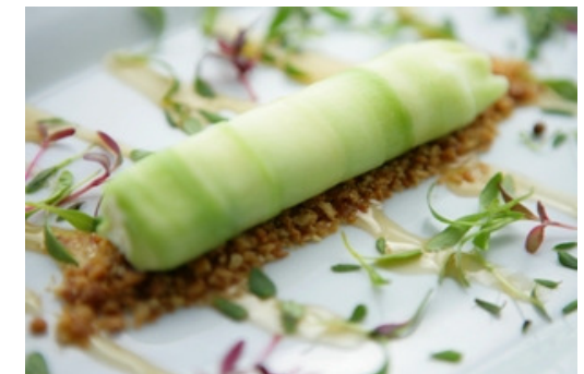
MARTIN BOSLEY - New Zealand's Best Restaurant 2007